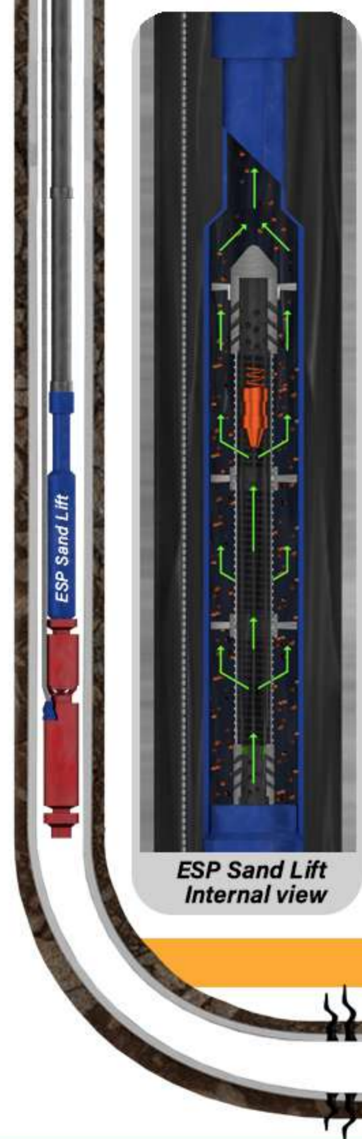
ESP Sand Lift Internal view